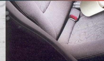
U.P.T. FABRIC PROTECTOR