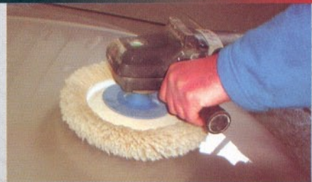
BUFFING WASH & CLEAN