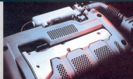
MOTOR CARE ENGINE PROTECTOR