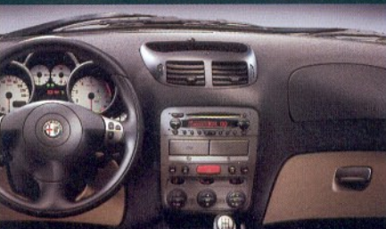
INTERIOR WASH & CLEAN